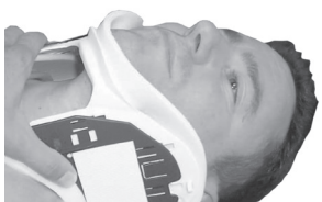
Figure 5 Supine