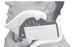
Figure 6 Seated